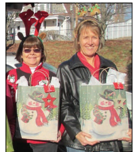
Central Maine Imaging Center staff donated 20 full gift bags in 2012!

We need to collect 75 large gift bags filled with new, full-size bottles of hygiene supplies, toilet paper, gloves, and socks. We are also seeking art supplies, alarm clocks, new adult-size underwear, new hooded sweatshirts (adult L, XL, & XXL), and local fast food or grocery store gift cards. Call 795-4077 if you can help!