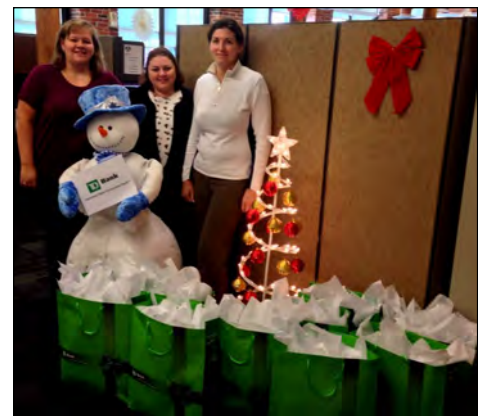
A big “Thank You” to the TD Bank employees who generously support the holiday drive each year!

If you can help, please call us at 207-795-4077 to sign up, or email info@newbeginmaine.org . Thank you for sharing the spirit of the season!