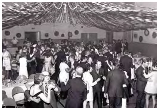
A New Years' Eve ball at the Lewiston JCC.