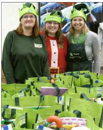
"Elves" from TD Bank donated holiday gifts and volunteered to sort hundreds of donations in 2015.

Thanks to the generosity of supporters like you, each December New Beginnings distributes holiday gifts to over 70 youth in our programs in Lewiston, Augusta, and Farmington.