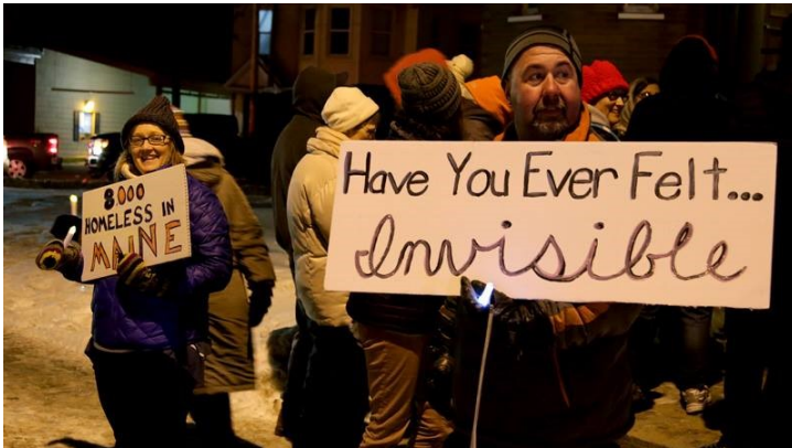
Supporters raise awareness at the annual Homeless Memorial in Lewiston this December.

SPONSORS NEEDED FOR OUR Annual Celebration Dinner May 2, 2018 Martindale - Auburn, ME Get great visibility for your business while making a difference for homeless youth! Call 207-795-4077 or get details at WWW.NEWBEGINMAINE.ORG