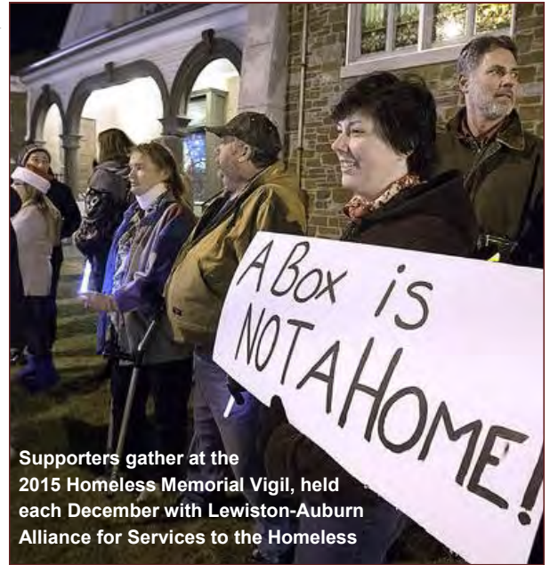
Supporters gather at the 2015 Homeless Memorial Vigil, held each December with Lewiston-Auburn Alliance for Services to the Homeless