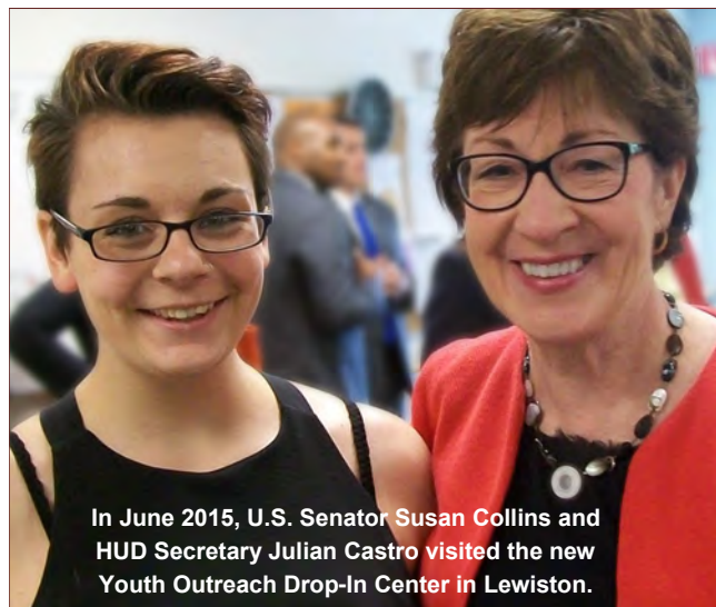
In June 2015, U.S. Senator Susan Collins and HUD Secretary Julian Castro visited the new Youth Outreach Drop-In Center in Lewiston.