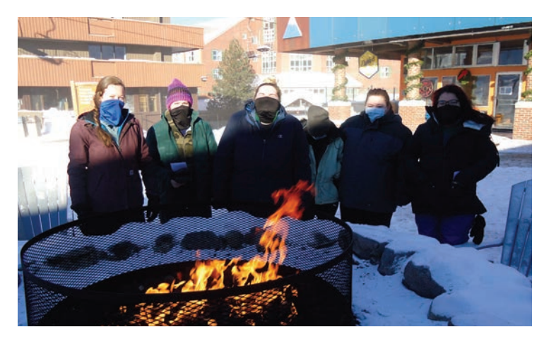
Staff and youth warm by the fire after a long day at the mountain.

The trip is a great break from reality for all participants. Youth begin with dinner near Sugarloaf, then a night of cable tv or time in the hot tub, followed by a good night's sleep. The next