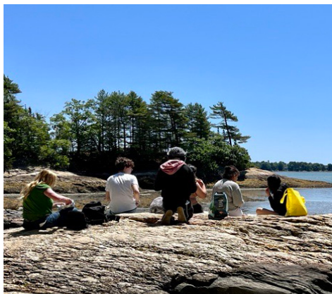
Youth enjoying a trip to Wolfs Neck State Park with the Education & Employment Program.