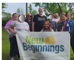
NB youth, supporters, and staff at Pride L/A on June 10, 2023