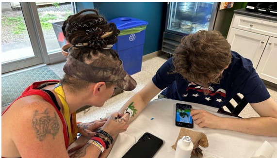
Pictured above: New Beginnings youth and staff enjoyed doing many summer activities including body painting.