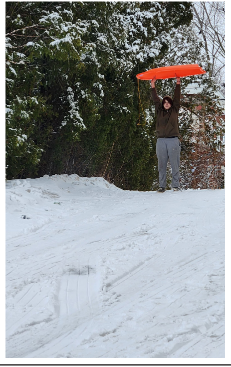
New Beginnings youth and staff enjoy some sledding during a recent snow day.